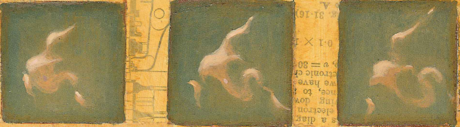
NORMAL AND OTHER DISTRIBUTIONS